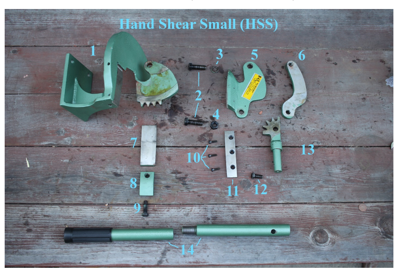
Hand Shear Small (TK No. 1 Hand Shear)